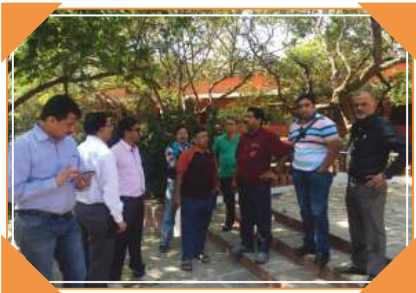
Venue inspection, Mahabaleshwar - Inspecting Trade Area