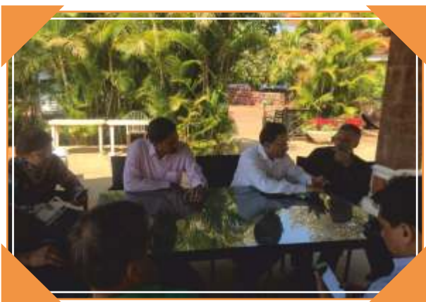
Venue inspection, Mahabaleshwar - Discussion on arrangements