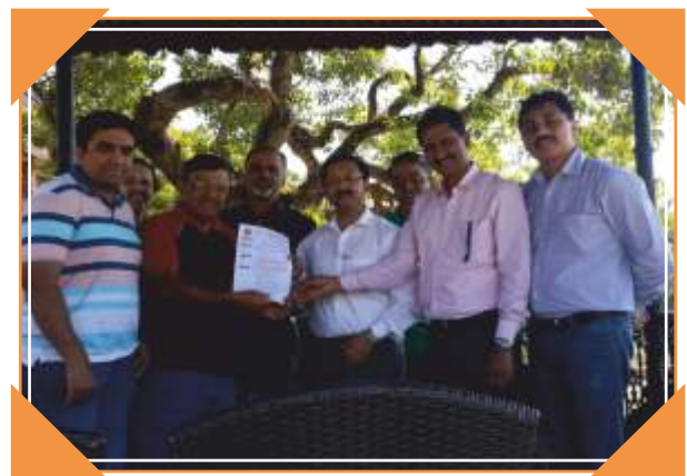
Venue inspection, Mahabaleshwar - MoU Signed between ACS(I) and Organizing Committee