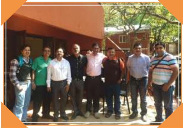
Venue inspection, Mahabaleshwar - Organizing Committee with Confidence