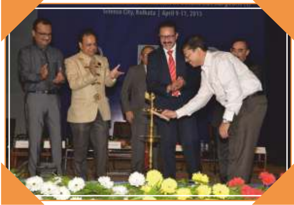
ACSICON 2015 - Inauguration of ACSICON 2016