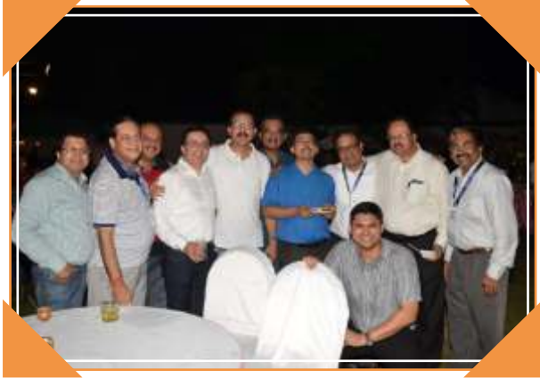
ACSICON 2015 - Stalwarts in Banquet