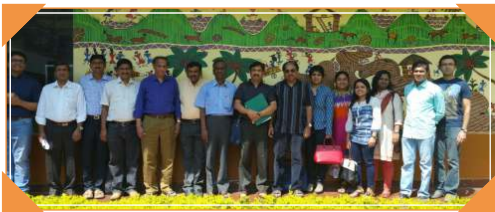
WCOCD 2017 - Organizing Team