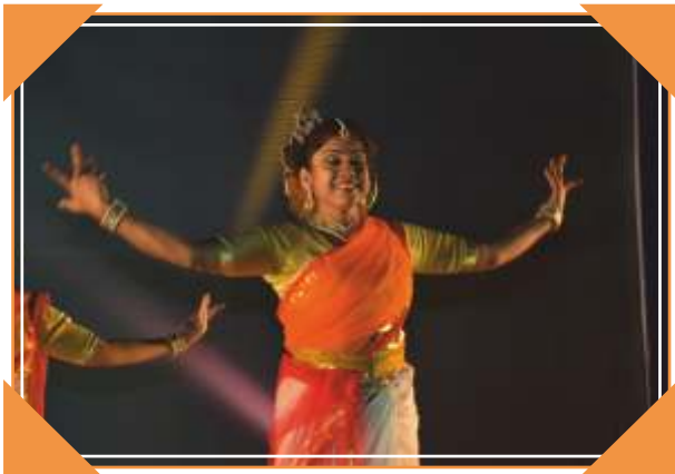
ACSICON 2015 - Cultural Night