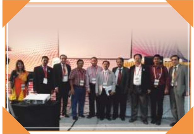
ACS(I) Central Council Meeting, Coimbatore 2016