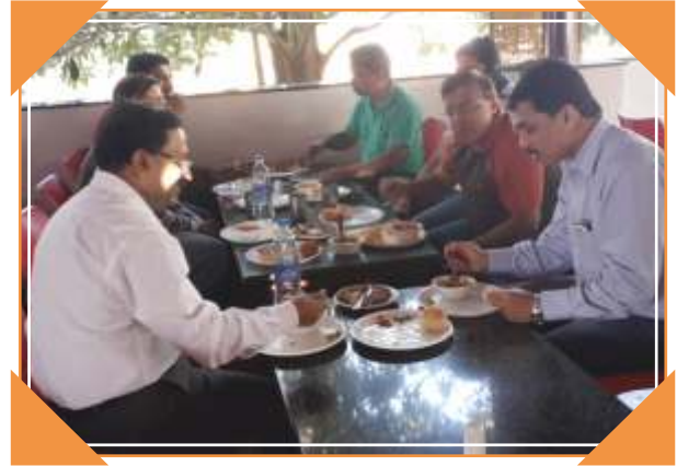
Venue inspection, Mahabaleshwar - Morning Breakfast of Maharashtra Special