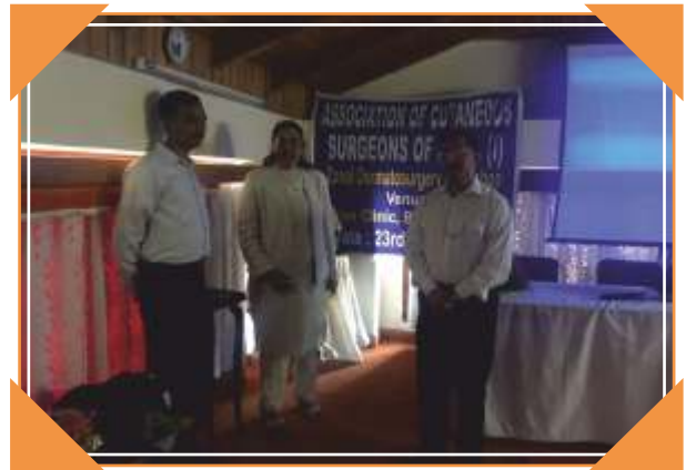
Zonal Focused Workshop (Shillong) - Expert Faculty on Discussion