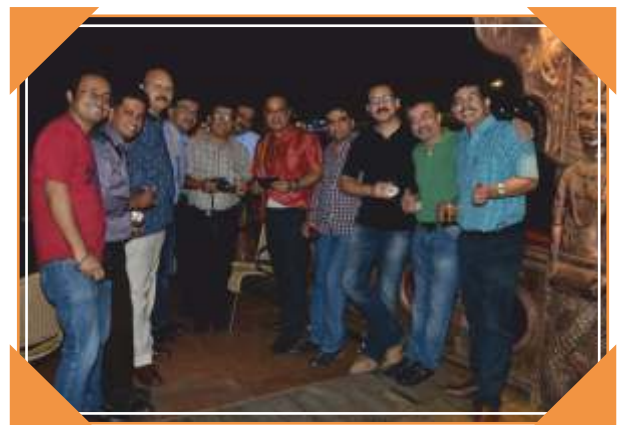
ACSICON 2015 - Faculty Dinner in Boat House