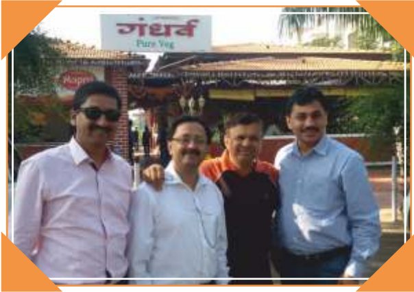
Venue inspection, Mahabaleshwar - Organizing Chairman with Inspection Team on the way to Venue