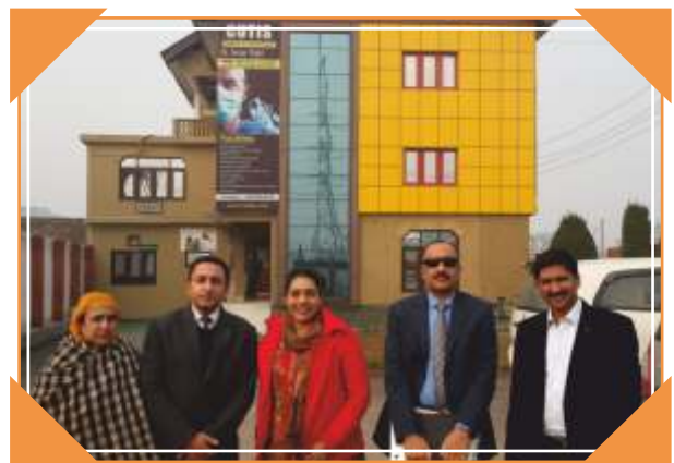
Inspection Team for Centre Recognition for Fellowship- Srinagar