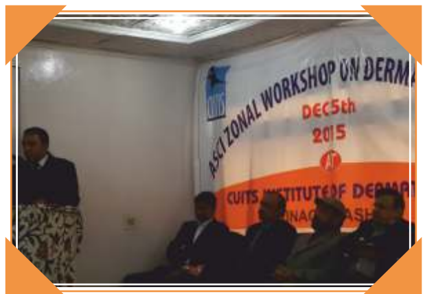
Zonal Focused Workshop (Srinagar) - Inauguration - First Zonal Workshop at CUTIS, Srinagar