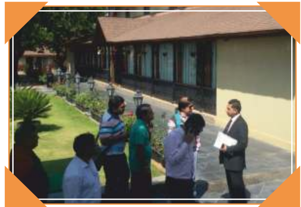
Venue inspection, Mahabaleshwar - Inspecting Banquet Area