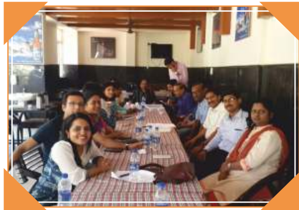
WCOCD 2017 - Preliminary Meeting of the Organizing Committee