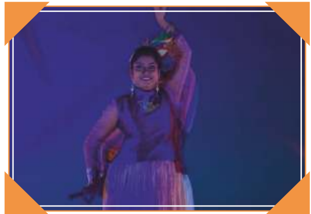
ACSICON 2015 - Cultural Night