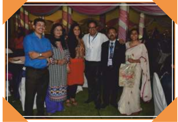
ACSICON 2015 - Banquet Time