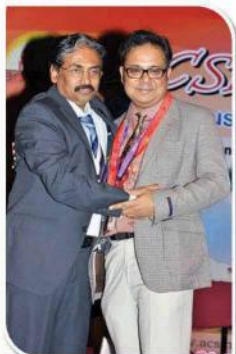
The Incoming and Outgoing Presidents