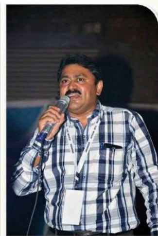
Moods from the Cultural evening : ACSICON 2013