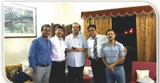
ACSICON 2015_First meeting of Core Committee