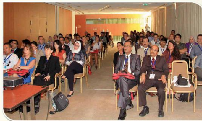
ACS(I) Session at WCOCD 2013, Athens