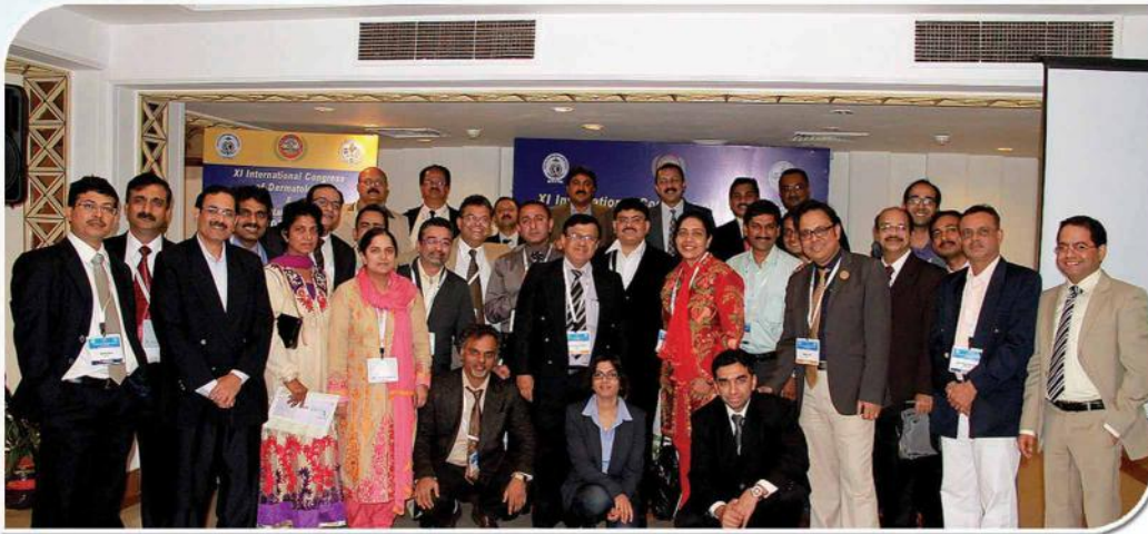
The ACS(I) Central Council