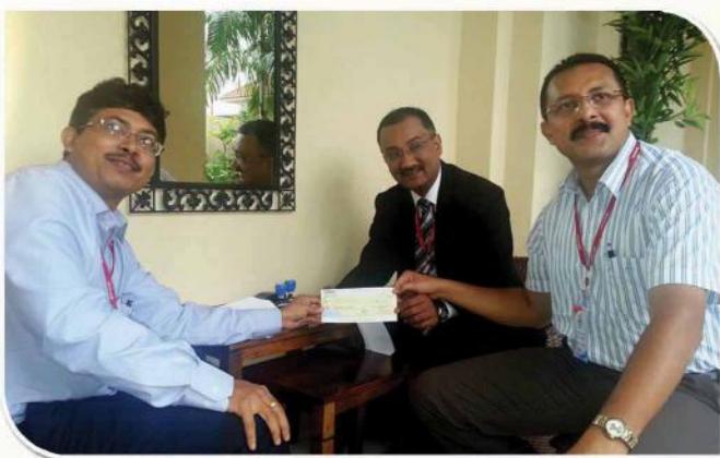
Seed money for ACSICON 2015