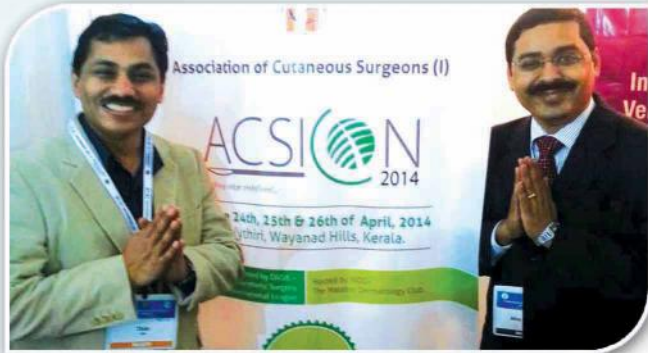
Welcome to Wayanad