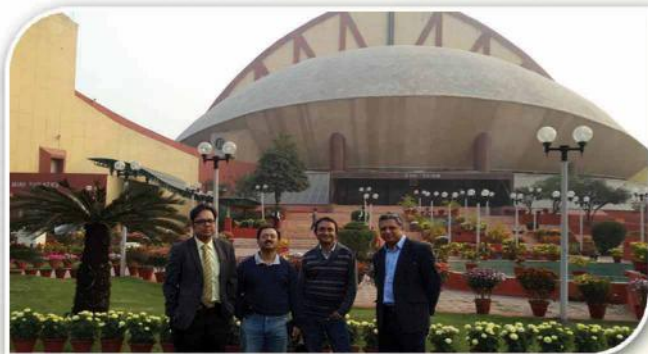
ACSICON 2015 Venue : Science City, Kolkata