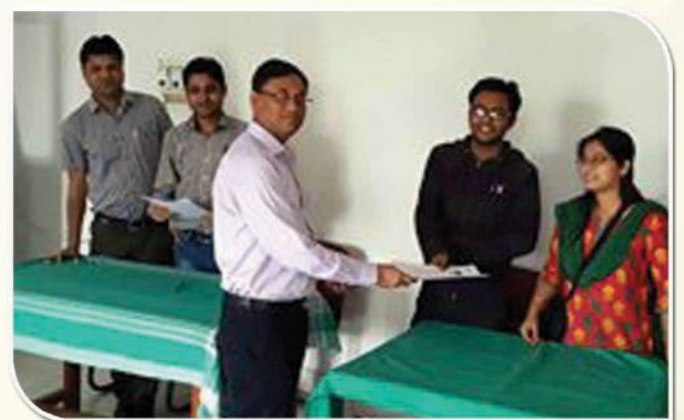
ADDQ 2014 National Prelims