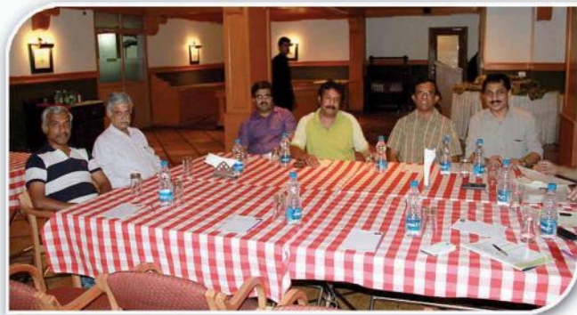
Team ACSICON 2014