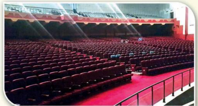
ACSICON 2015 Venue : Plenary Hall