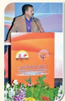
The Incoming Hon. Gen. Secretary