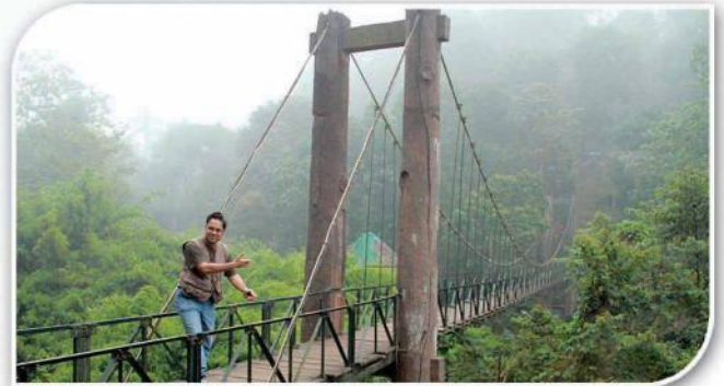
Explore the Lap of Nature