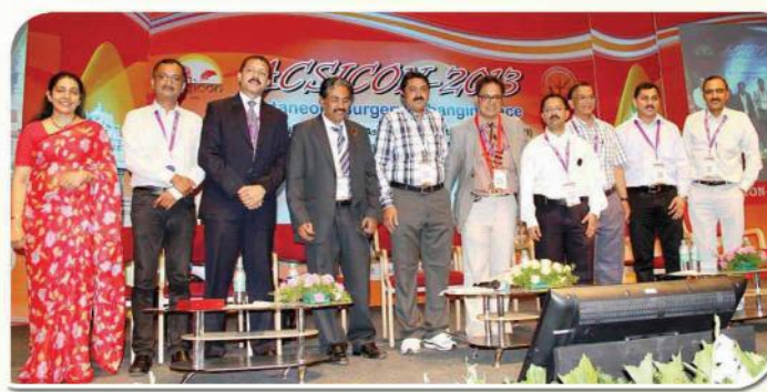
The ACS(I) Executive Committee 2013-15