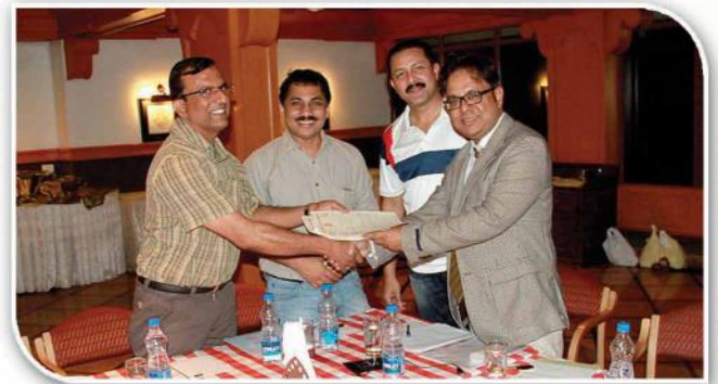
The signing of the historic ACSICON MoU