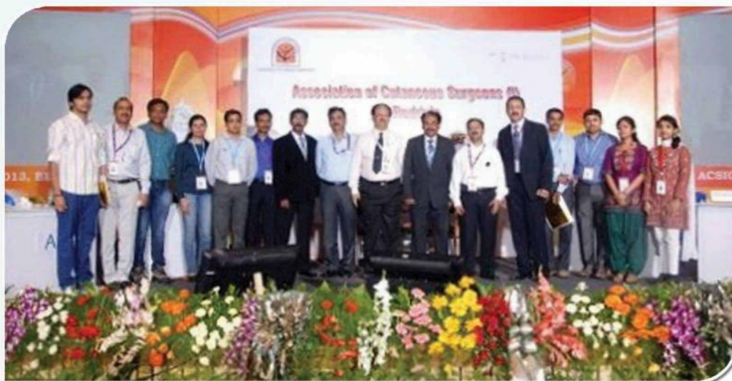
ADDQ 2013 National Finalists : ACSICON 2013