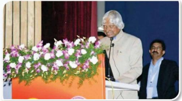
The Chief Guest speaks