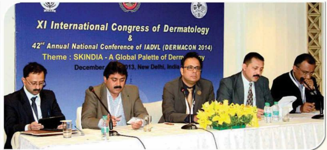
The first Central Council Meeting of ACS(I) at Delhi