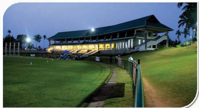
Venue for Cricket Match and Banquet